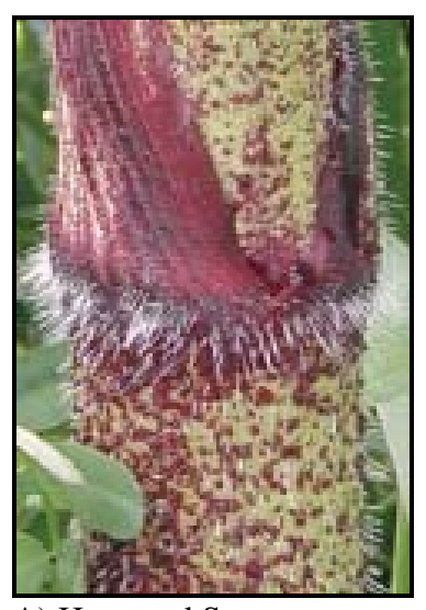
A) Hogweed Stem

Giant Hogweed is most easily identified by its massive size. The plant can reach heights of 10 to 15 ft. The large hollow stem is 2 to 4 inches in diameter with ridges, dark reddish purple spots and white bristles. The compound leaves have 3 deeply incised leaflets and can grow up to 5 ft wide. Hogweed is also easily recognized by the numerous white flat-topped flowers clustered in an umbrella shaped head that can grow up to 2.5 ft wide. It flowers in June and July.