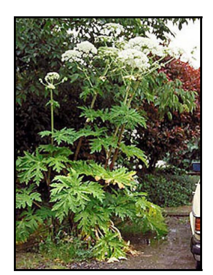
D) Entire Giant Hogweed plant